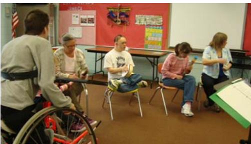
PSSD Students Enjoying Music Class