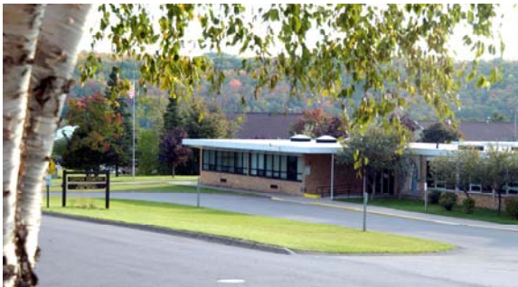
Our 809 Hecla Street facility in Hancock.